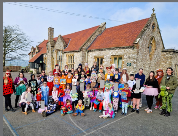
WORLD BOOK DAY AT BUCKLAND