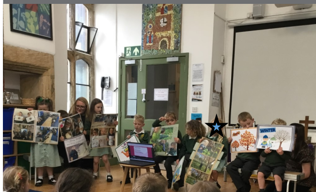
Buckland St Marys First 'Praise and Share' Assembly was led by Ash Class